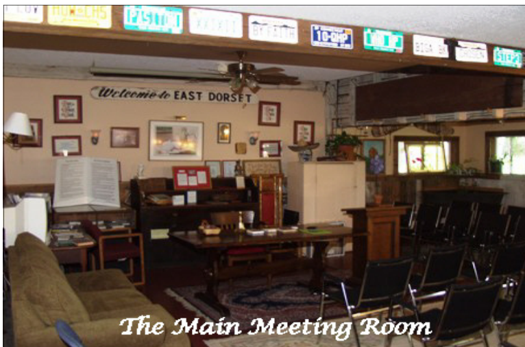
The Main Meeting Room

This information taken from http://www.wilsonhouse.org